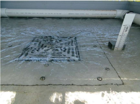
Surcharged Flow – 12 L/s (25mm)